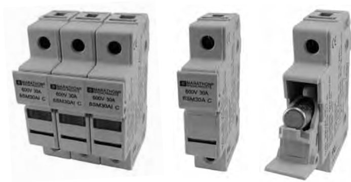
Shown left to right: 6SM30A3I-C, 6SM30A1-C, 6SM30A1-C shown with fuse (fuse not included)